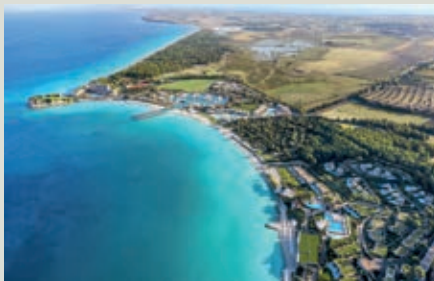
SANI RESORT, GREECE

GIC took a majority stake in Sani/Ikos Group last year, operator of over 2,750 rooms in Greece and Spain valuing the company at €2.3 bn.