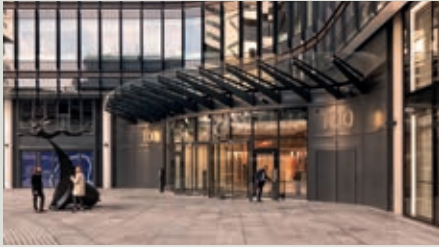
100 LIVERPOOL STREET, LONDON

British Land and GIC's 440,000 ft 2 (40,800 m 2 ) 100 Liverpool Street development in London's CBD became the first net zero carbon development for British Land in the UK upon completion in November 2020. British Land and GIC are investing more than €1.5 bn in the whole Broadgate office campus in a 10-year programme, of which 100 Liverpool Street is a key part. GIC acquired a 50% interest in the Broadgate estate from Blackstone in 2013. 100 Liverpool Street is fully let. The upper floor of the project is let to Hudson River Trading for 10 years. British Land's flexible workspace platform, Storey, is also leasing space, along with retailers and restaurants. GIC says it is committed to the global transition to a net zero economy. It has been proactively ensuring its real estate investments meet standards on carbon and energy intensity.