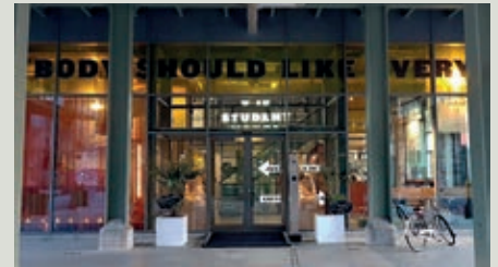
THE SOCIAL HUB, NETHERLANDS