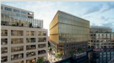
TRIBECA, KING'S CROSS, LONDON

In February 2023, four parties announced a partnership to develop an 830,000 ft 2 life sciences quarter with labs alongside retail, restaurants, and residential. GIC is joining with REEF Group, BlackRock Alternatives Real Estate, and British Airways' New Airways Pensions Scheme.